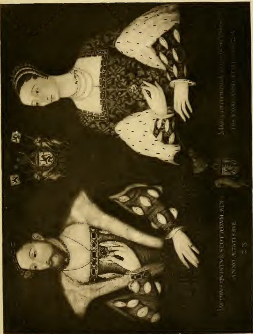
JACOBVS QVINTVS SCOTTORVM REX ANNO AETATIS AVE